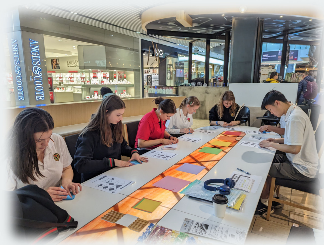
2023 Great Amazing Race (Japanese Students)

Note: students who change into VCE VM after commencement week will need to catch up on OHS work delivered during commencement week. The catch-up is delivered by online external providers and will cost the student approximately $200.